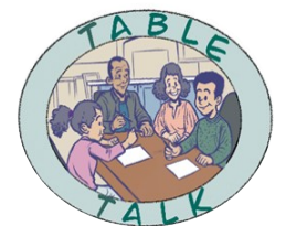
Table Talk: topics and questions from Religious Studies

This week, our Year 12 students started studying a topic on how Christians view and understand the Bible. They discussed the importance of examining the context of Bible passages and understanding verses within their broader framework. Additionally, students began to grasp the concept that different sections of the Bible serve distinct purposes and pondered the role of influences, such as tradition, in shaping one's interpretation of the Bible.